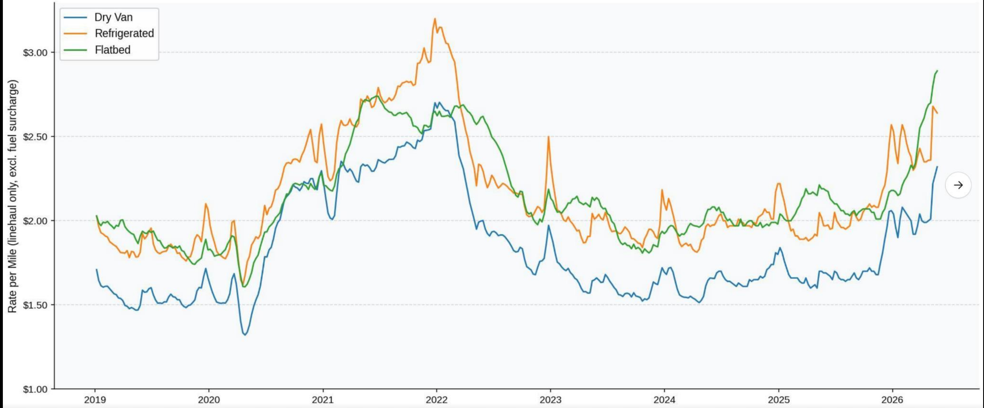
National Spot Linehaul Rates by Equipment Type 7-Day Rolling Average, Through Week 22, 2026